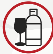
Liquor Store & Bottle Shops