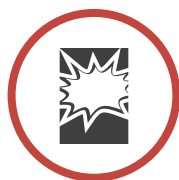
Comic Book Shops