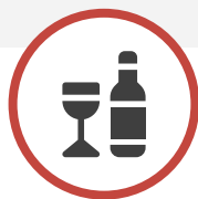
Liquor Store & Bottle Shops