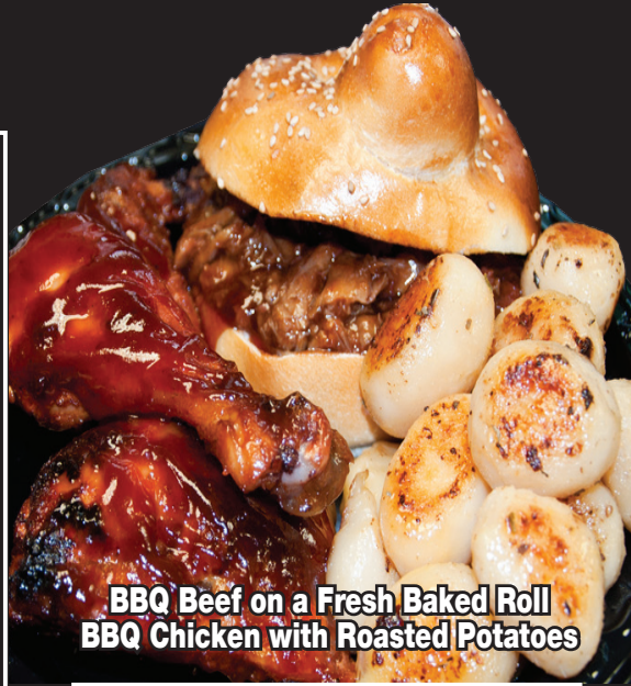
BBQ Beef on a Fresh Baked Roll BBQ Chicken with Roasted Potatoes

BBQ #1 $15.95 p/p Choice of 2 meats, 2 sides & corn bread (Honey Glazed)