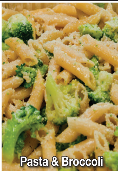
Pasta & Broccoli