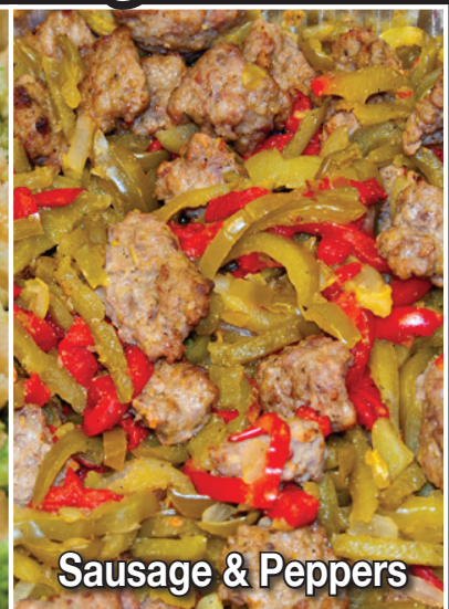
Sausage & Peppers