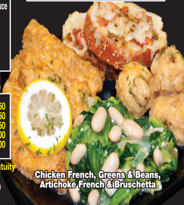
Chicken French, Greens & Beans, Artichoke French & Bruschetta

Place Setting p/p $2 • Utensils Only p/p $1 Individual Serving Spoon $2