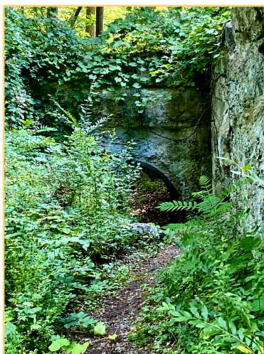
Portal to our Tanseki adventure