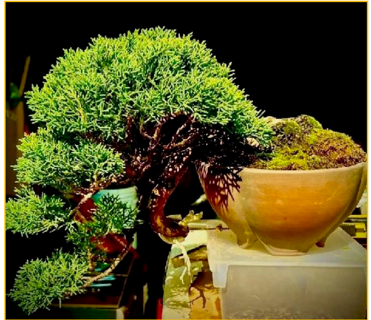
Another Shohin picture from Mark, just because there is a spot for it (See p. 4 for Shohin corner)

And new members - don't be shy. Reach out to all of us at meetings and let us know how your trees are doing.