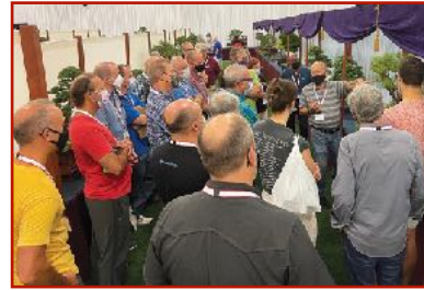
Tour the show with an expert during a critique.

Monday, September 4 (yes, that's Labor Day) - be at International Bonsai Arboretum at 9:30 am to load the truck with many of the display structures for the show. If you have a truck and can make it available on Monday and Tuesday, to load and unload, that is very helpful.