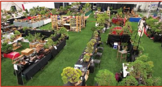
A well stocked vendor area will meet all your bonsai needs.