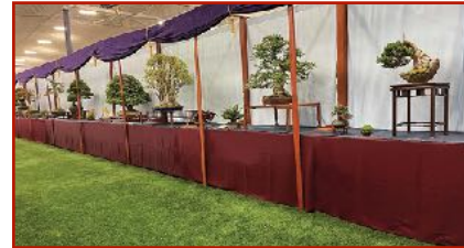
Beautiful trees in a beautiful display