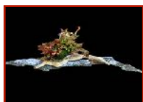
Accent for this year's Winter Silhouette