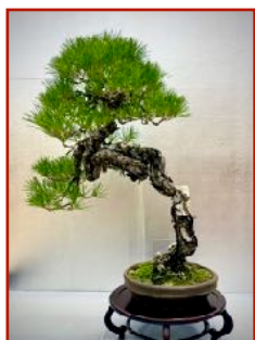
NOT a Christmas Tree but a very fine Japanese Black Pine from Taikanten