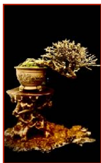
Displayed last year Winter Silhouette Bare Larch