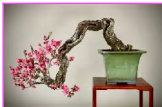
Japanese flowering plum