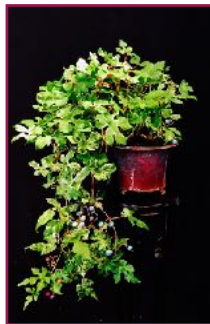
Variiegated porcelain berry