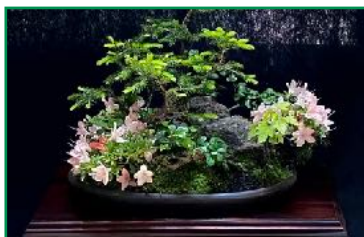
Early Summer Scene