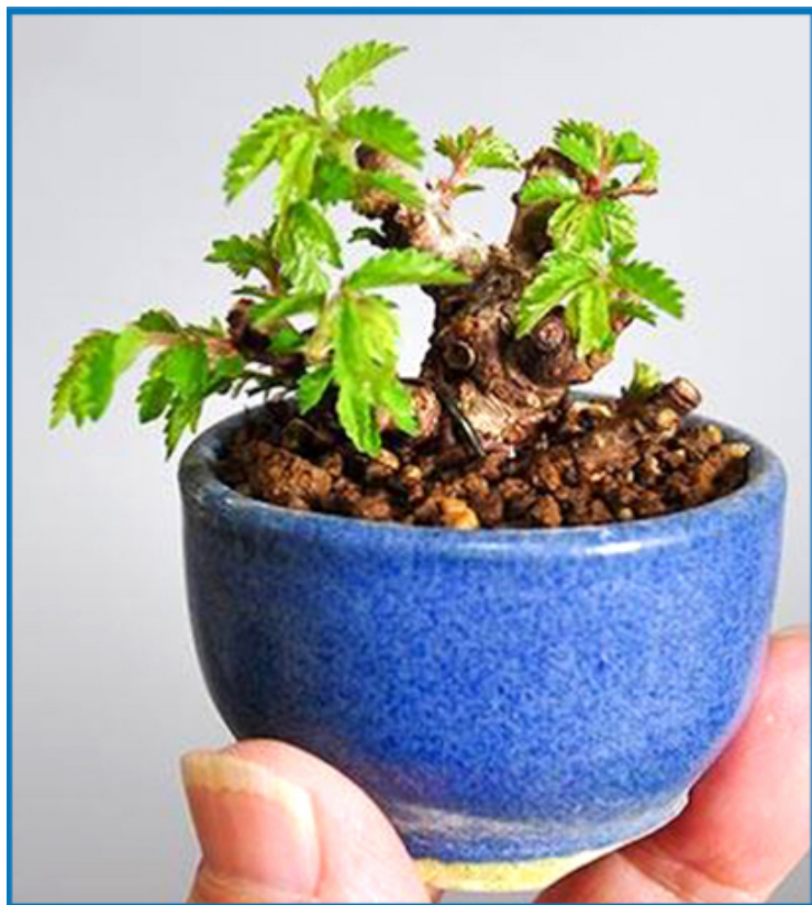
Shohin Bonsai, Variety: Chinese Elm

Developing a Mame size Shohin bonsai, start with a tapered trunk with a heavy base and cut it back drastically to force back budding. The back budding will become new branches, which will grow and be cut back drastically again and again to become secondary branches. This technique will be performed over and over again until a dense pattern of branches is created. Even though this pot is small it is oversized for the size of the tree to supply it with extra nutrients for dense branch production.