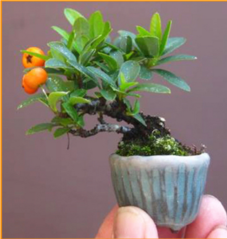
Mame Shohin Bonsai, Pyracantha

Bonsai this small have a natural built in charm that is appealing even though it may not have some of the good features of a larger bonsai. This bonsai doesn't have a good taper or a clear branch structure, but it has other good characteristics. A clear focal point, the Orange fruit, interesting contrast of textures, the foliage mass and the subtle pattern on the pot. Is it a Slanting or Semi-Cascade style Twin Trunk? There are strong arguments for both styles. I feel it is a Semi-Cascade for two reasons, the style of pot, the shape is a Shohin size Cascade pot and the tree is extending out over and past the edge of the pot. With Mama size bonsai, even with a trunk that is not perfect the foliage mass, fruit and/or flowers can compensate and make for a charming bonsai.