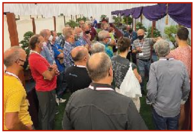
Tour the show with an expert during a critique.

Monday, September 4 (yes, that's Labor Day) - be at International Bonsai Arboretum at 9:30 am to load the truck with many of the display structures for the show. If you have a truck and can make it available on Monday and Tuesday, to load and unload, that is very helpful.